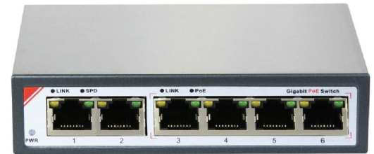
Non management (LPG6-4Px-N)

It has non management (LPG6-4Px-N), or L2+ managed type(LPG6-4Px-M).