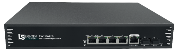
L2+ managed type (LPG6-4Px-M)